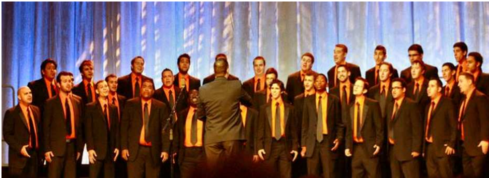
South Florida's HD Chorus took first in 2012

the Sunshine District, so make plans to attend January 8-13 in Orlando.