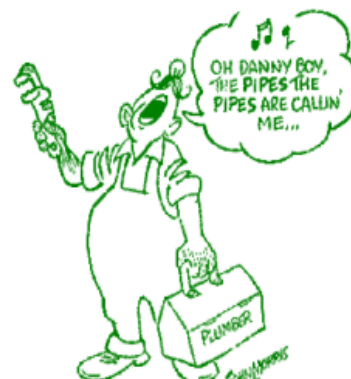
Grauberger tries out for lead part in "Irish Show"